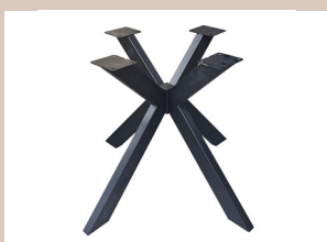
TABLE BASE FOR ROUND TABLE TOPS