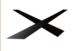
TABLE BASE FOR RECTANGULAR TABLE TOPS