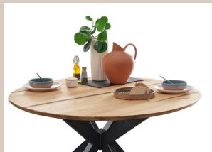
TABLE TOPS ROUND